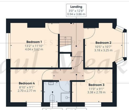
Floor 1 Building 1